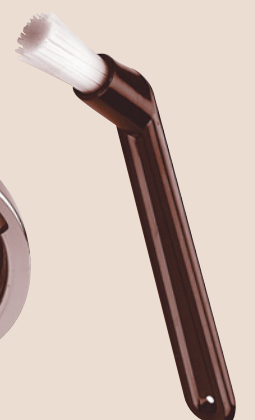
head cleaning brush