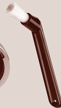
head cleaning brush