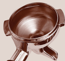
group handle or portafilter